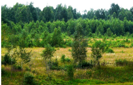
Abandoned agricultural land in Russia

Halle (Saale), Germany, 4 December 2013 – There exists widespread agricultural land abandonment in the territory of the former Soviet Union. Recultivation of this land would help meet the increasing food demand of a growing world population. However, the soil and vegetation of these areas store significant amounts of carbon and recultivation would result in high carbon emissions and thereby contribute to global warming. Researchers from the Leibniz-Institute for Agricultural Development in Central and Eastern Europe (IAMO), of Humboldt-Universität zu Berlin and Potsdam Institute for Climate Impact Research have developed a model which allows a better understanding of the spatial distribution and abandoned land and thereby of the agricultural potentials of this region. Furthermore, it helps identify areas where recultivation is associated with lower carbon emission. The results of this study can be found in the article „Post-Soviet cropland abandonment and carbon sequestration in European Russia, Ukraine and Belarus“, which was published in the renowned scientific journal Global Biogeochemical Cycles .