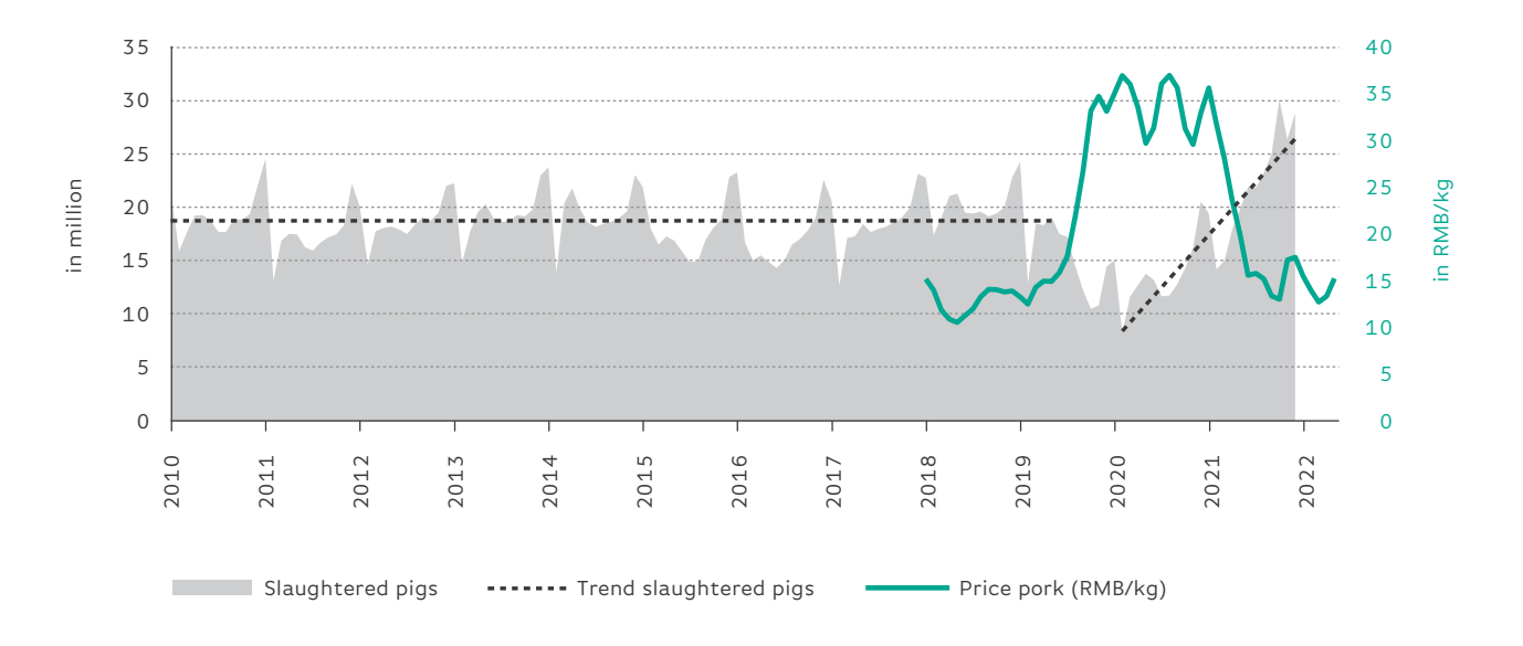
Figure 3: Slaughtered pigs and pork price, China (only hog farms above national standard). Data: Own depiction, data from the Chinese Ministry of Agriculture and Rural Affairs.

Finally, sales from national strategic wheat reserves were halted in April 2022 and were further boosted by national procurements in June.