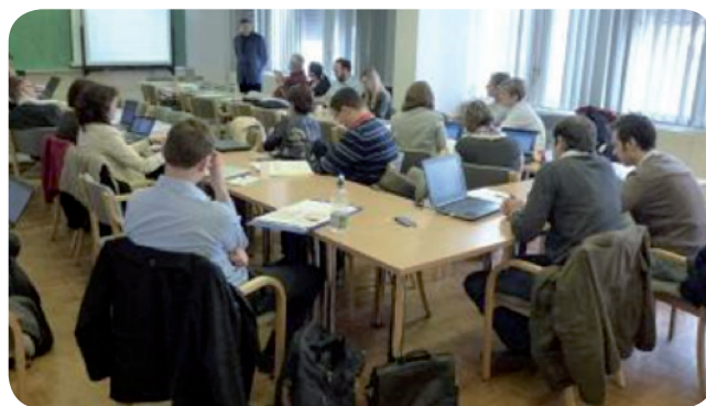
3 rd Project meeting in Budapest

All partners stressed the importance of each member institution's involvement in every project work package, in order to share information and nourish scientific discourse. To secure the high quality of the deliverables, the internal revision process was defined.