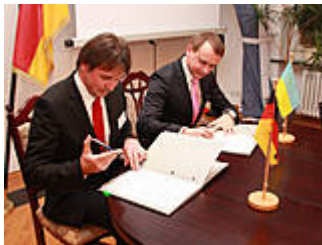
Conclusion of contract in Berlin