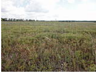
Recultivable areas, Photograph: F. Schierhorn (IAMO)