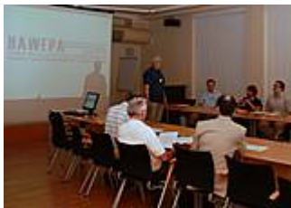
The last HAWEPA workshop took place in 2010, Foto: T. Török (IAMO)