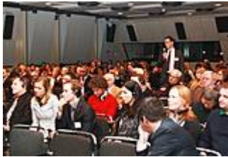
Lively discussions about foreign agricultural investments