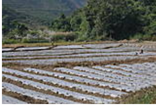
Agricultural land in China