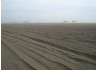
Wind erosion on agricultural crop land in the Kulunda Steppe