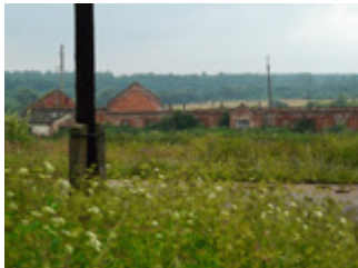
Abandoned land in Russia