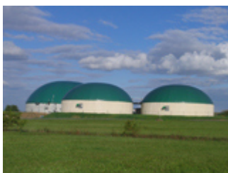
Biogas plant in Flemmingen, close to the city of Naumburg