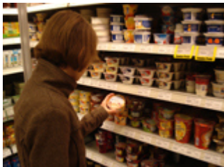
Price formation depends on which brands costumers choose, among others