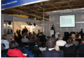
IAMO symposium at the EuroTier fair